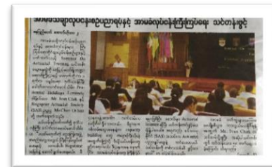
Local media coverage!