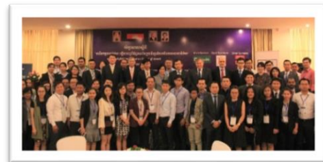
Group photo from the Phnom Penh seminar in 2017