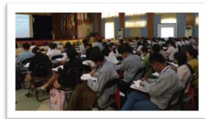
Learning In Progress...